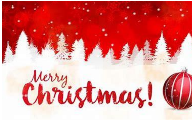
Christmas long ago in Rockford